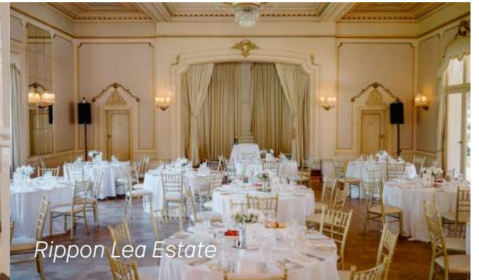
Rippon Lea Estate