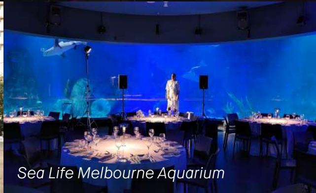
Sea Life Melbourne Aquarium