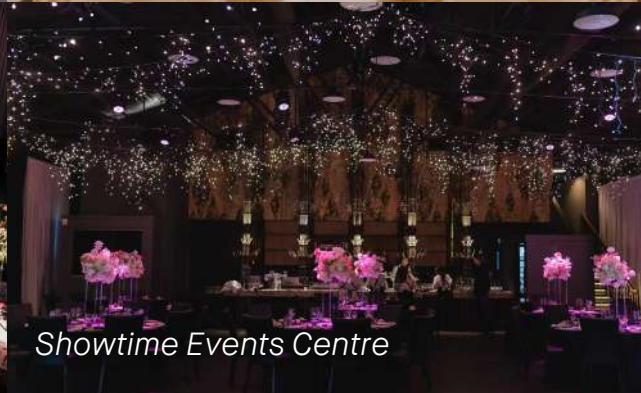
Showtime Events Centre