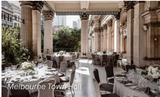
Melbourne Town Hall