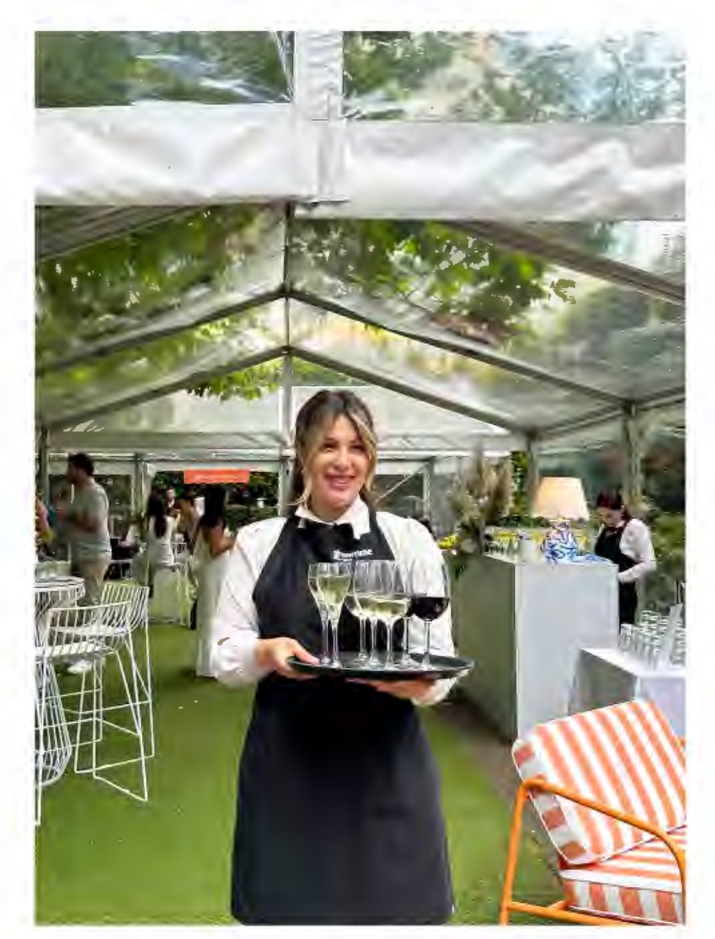
*If your wedding booking is within 6 months, alternative arrangements may be offered for your tasting. Please speak to your Wedding Sales Executive prior to booking should you have any questions. Otherwise, your Wedding Producer will advise the options during planning.