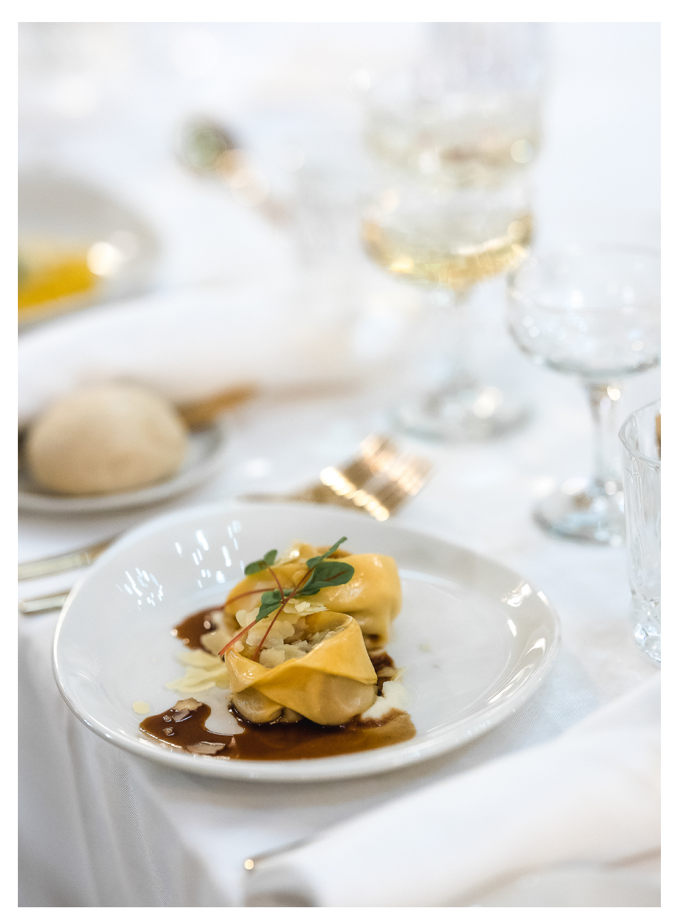
*If your wedding booking is within 6 months, alternative arrangements may be offered for your tasting. Please speak to your Wedding Sales Executive prior to booking should you have any questions. Otherwise, your Wedding Producer will advise the options during planning.