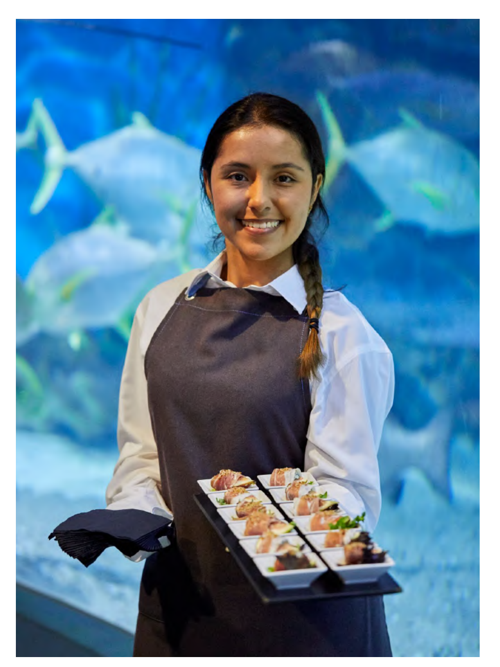
*If your wedding booking is within 6 months, alternative arrangements may be offered for your tasting. Please speak to your Wedding Sales Executive prior to booking should you have any questions. Otherwise, your Wedding Producer will advise the options during planning.